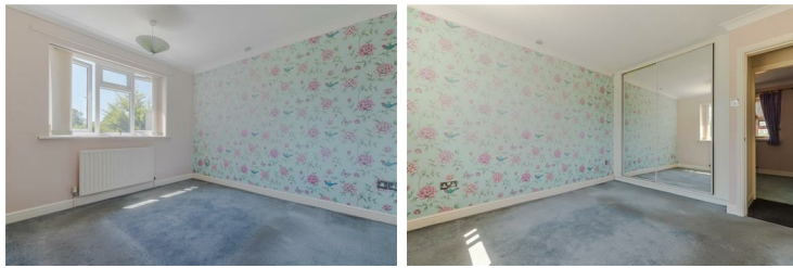
Bedroom one 10'5" x 10'4" (3.20 x 3.17)