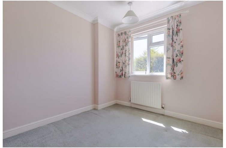
Bedroom three 9'5" x 9'3" (2.88 x 2.84)