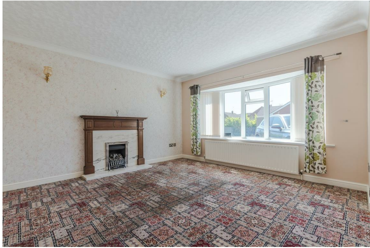
Lounge 13'4" x 12'9" (4.07 x 3.90)