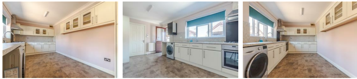
Kitchen/Diner 17'6" x 8'11" (5.34 x 2.72)