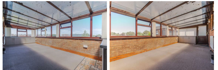
Conservatory 24'4" x 9'4" (7.44 x 2.85)